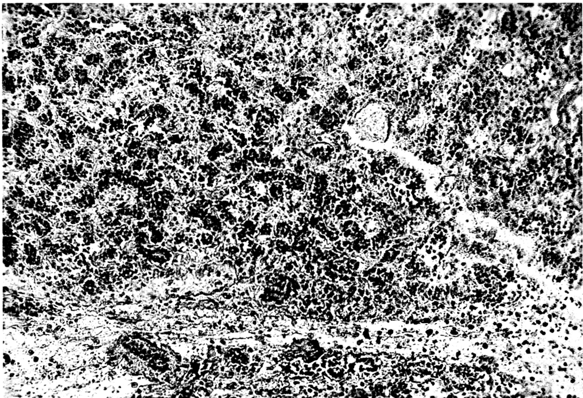
FIG. 2.—The same tumor after the subcutaneous injection of 18 mgm. of progesterone. Mag. about \times 300 .